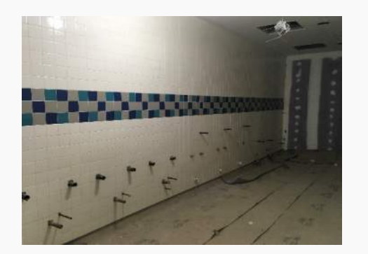
Wall Tile Bathroom Upper Level Addition