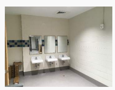
Bathroom Fixtures in Renovation