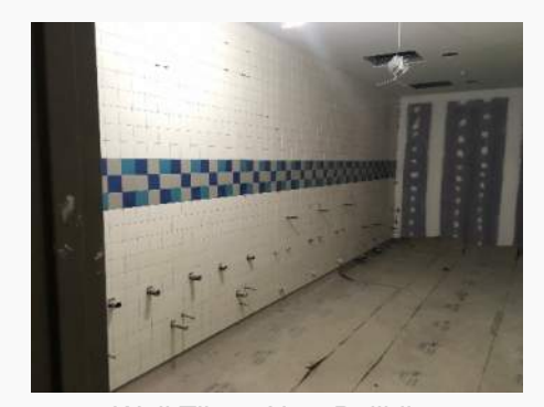
Wall Tile at New Builiding