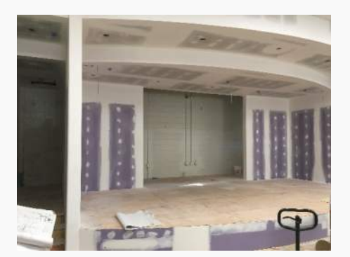
Stage at Auditorium