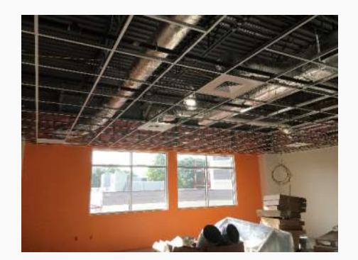
Paint & Ceiling Grid at Classrooms