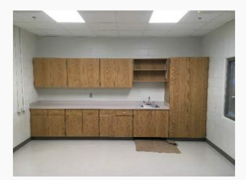
Millwork in Renovation