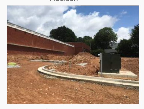
Curb and Gutter at Service Drive