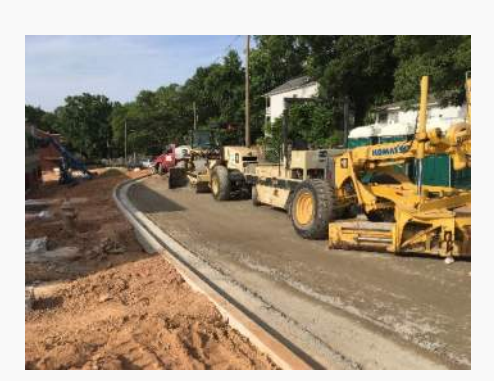
Curb & Gutter at Bus Loop