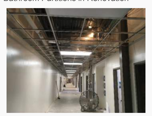
Ceiling Grid at New Building Upper Level