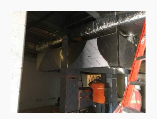
Kit. Hood Exhaust Tied In