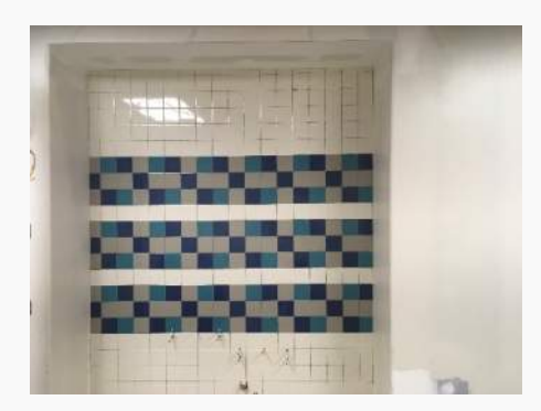
Wall Tile behind Water Fountains at Upper Level Addition