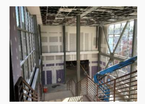
Lobby Window Wall, Duct, Ceiling Grid, & Gyp. Bd.