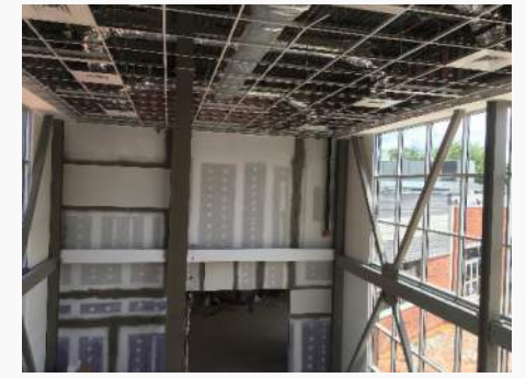
Lobby Window Wall, Duct, Ceiling Grid, & Prepped Gyp. Bd.