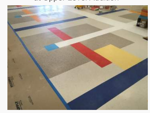
VCT Flooring at Auditorium in New Building