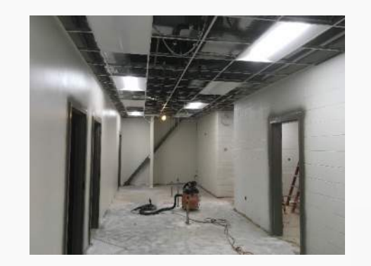
Kit. Service Area