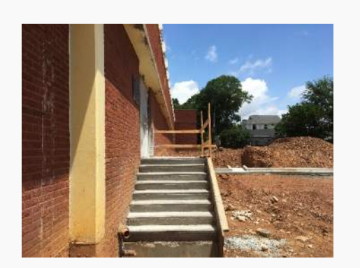
Ext. Conc. Stair at 60's Building