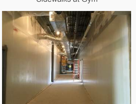
Painting Corridors at New Building Upper Level